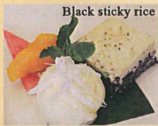
Black sticky rice

Baked Egg Custard 13.95 Custard with Taro | Ice cream