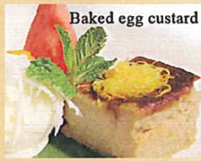
Baked egg custard

Thai Pothong Mixed Fruit Platter 10.95 [for 2] with Seasonal Fruits