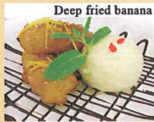
Deep fried banana