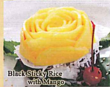
Black Sticky Rice with Mango

Deep Fried Banana [ Kluey Tod ] 14.9 Banana Coated with Thai sweet batter | Vanilla Ice Cream