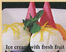
Ice cream with fresh fruit

Lychee 11.9 with Homemade Ice Cream of Your Choices